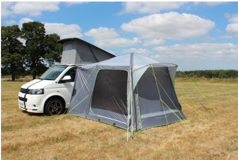
CAYMAN MIDI AIR